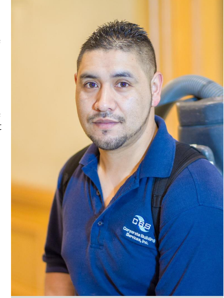
The "Invisible Force" that makes a visible difference for you

Our greatest asset at Corporate Building Services is our employees. We participate in the main trade organizations in our industry, such as ISSA, BSCAI, and NSC. These are sources of the latest technologies, research, and expert advice. Our industry experts keep us on the cutting edge of professional advancement to better serve our customers. But we recognize the value of experts on the other end of our industry – our employees. The very ones we